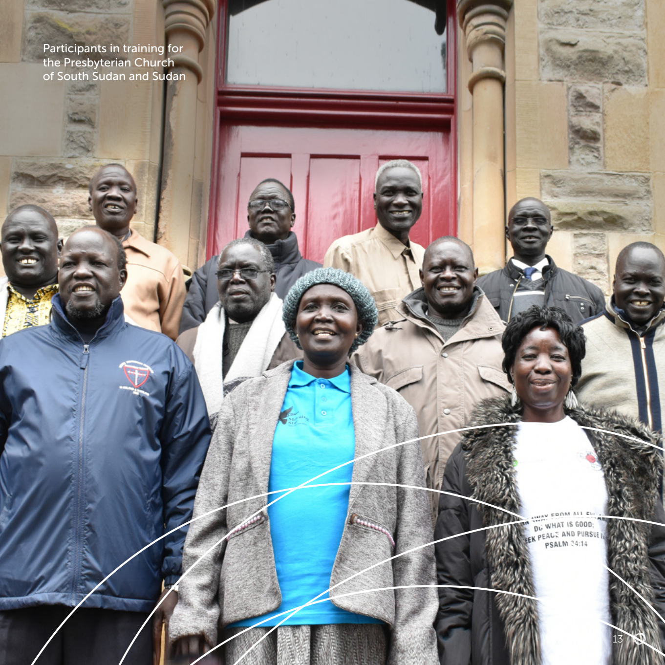
Participants in training for the Presbyterian Church of South Sudan and Sudan

DO WHAT IS GOOD; SEEK PEACE AND PURSUE IT PSALM 34:14